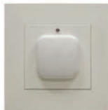
Indoor and Outdoor Enclosures