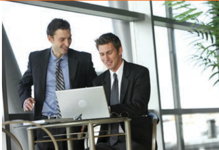
Aesthetically Pleasing Wi-Fi

Offices, Healthcare, Education, Retail, Hospitality