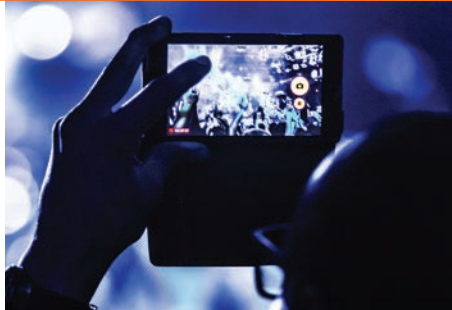
Large Public Venue Wi-Fi